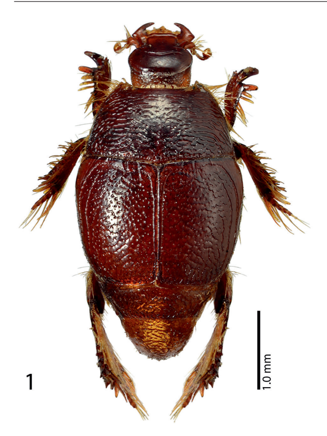
Figure 1. Ctenophilothis altus (Lewis, 1885) habitus, dorsal view.