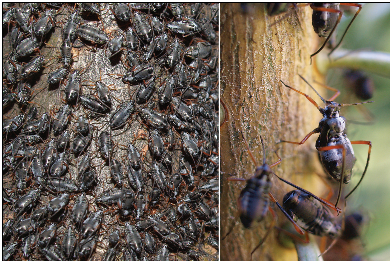
Figure 2. Cinara curvipes on the trunk of Abies concolor (29 May 2015).

found in these aphid colonies, but only at two sites, in small numbers, and not during the peak abundance of the aphid population ( \pm 3 larvae / 200 aphids). As observed by others (Jurc et al. 2009, Scheurer 2009, Scheurer and Binazzi 2004) ants ( Lasius niger L., Myrmica rubra L.) were present in some aphid colonies, but only at one quarter of the sites examined by us.