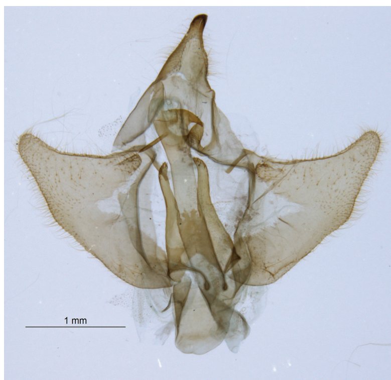
Figure 5. Vansoniella chirindensis sp. n., male genitalia slide Mey 85/17, caudal view

ticles; valva triangular, apex rounded, costal margin concave, inner side with a rounded hump on the basal dorsal corner close to vinculum; juxta large, covering the ventral and lateral sides of the phallus base and produced apically into a pair of finger-like processes bearing small dents on the tips, base of juxta with long and slightly curved apophyses, reaching into segment VIII; phallus tubular, longer than valva, apex with curved, dorsal process and short, subapical spine, directed ventrad; vesica without cornuti.