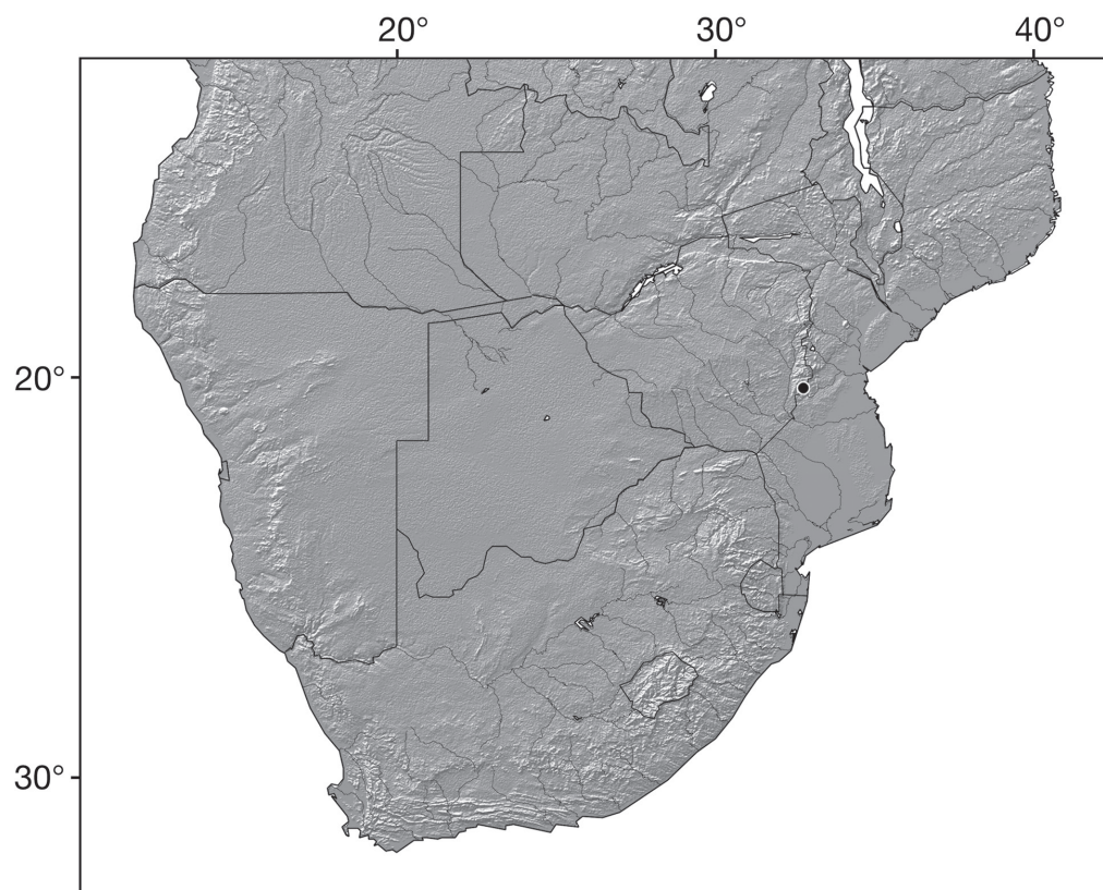
Figure 9. Map of southern Africa showing the type locality of V. chirindensis sp. n. in Zimbabwe (20°24'S 32°41'E).