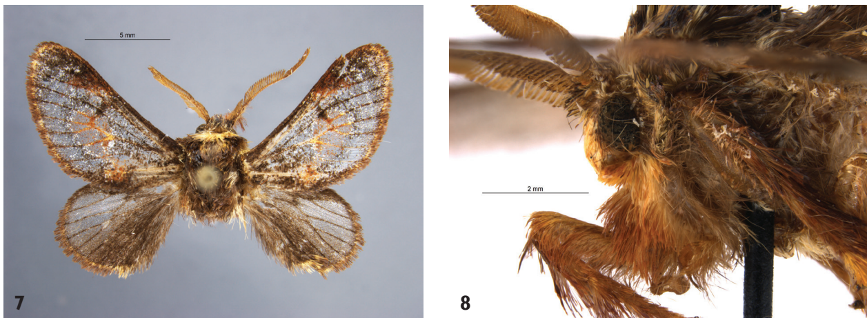
Figures 7–8. Vansoniella chirindensis sp. n., male holotype, 7. dorsal view, 8. lateral view of head and labial palpi.