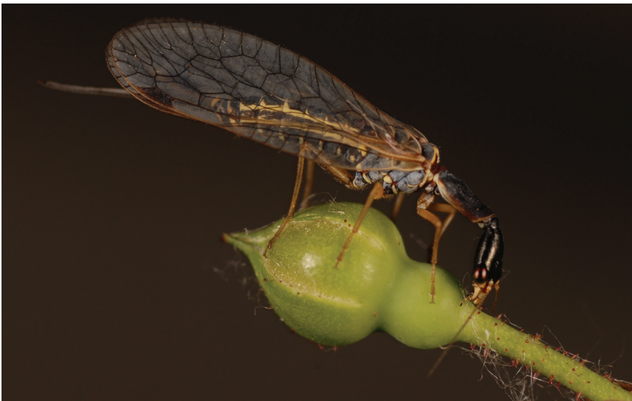
Figure 2. Ornatoraphidia flavilabris , female. Greece, Phokis, S Pendayi, 38°34.95'N, 22°03.45'E, 960 m, 31 May 2008, H. & U. Aspöck leg., now in coll. NHMW. Length of forewing: 10.5 mm.