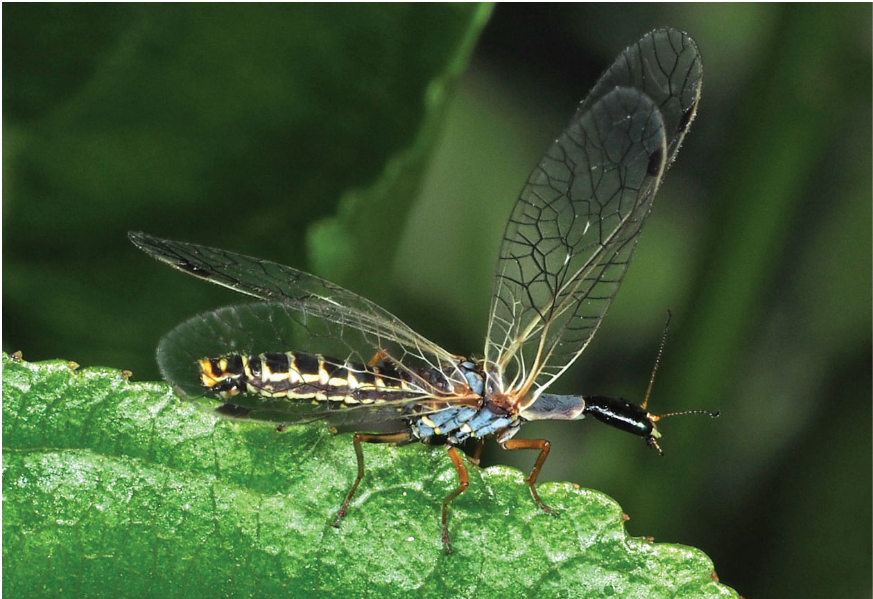
Figure 1. Ornatoraphidia flavilabris , male. Austria, Eichkogel, 48°03.75'N, 16°17.55'E, 358 m, 10 May 2021, H. & U. Aspöck leg., now in coll. NHMW. Length of forewing: 8.4 mm.